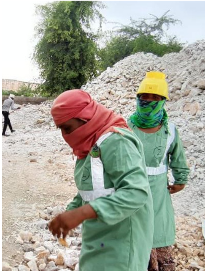
Welfare & Rights of Unorganized Sector Labourers