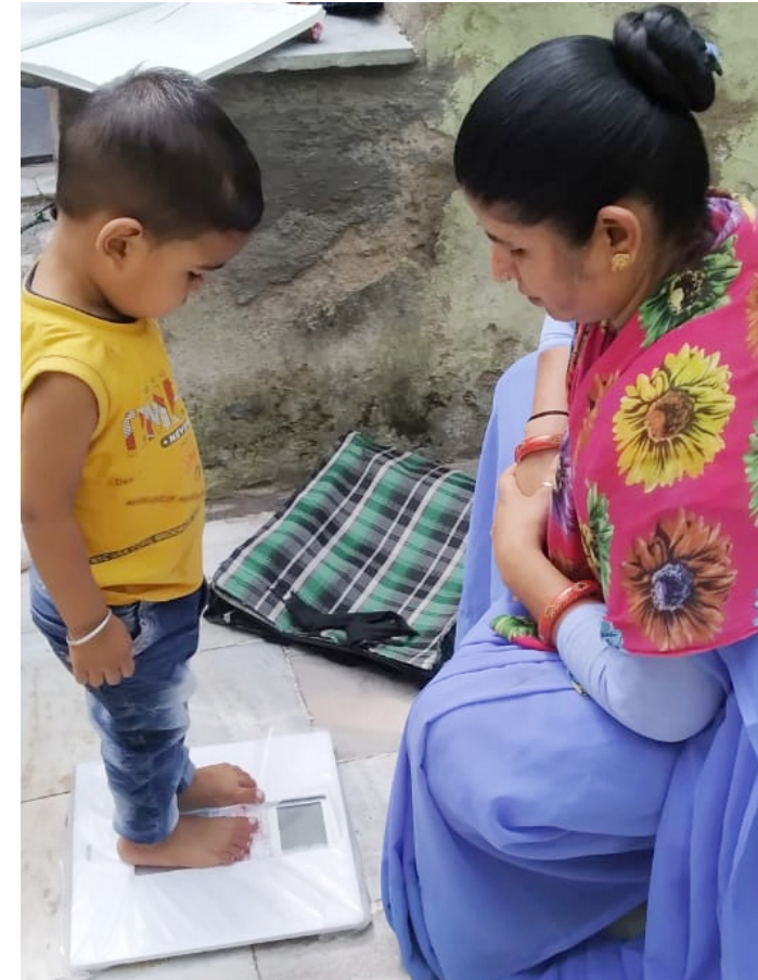
Child Development and Child Rights